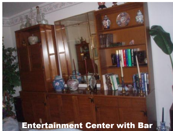
Entertainment Center with Bar