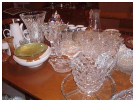
Fostoria, Depression & Milk Glass