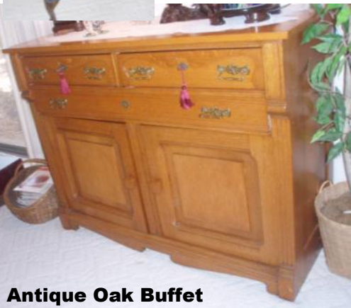
Antique Oak Buffet