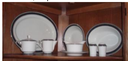
Stone China Midnight Dream