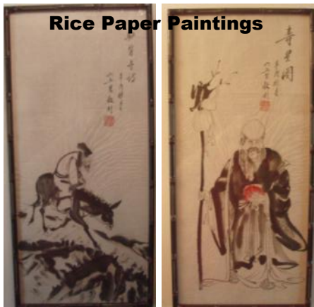
Rice Paper Paintings