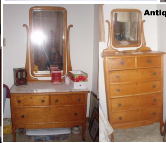
Antique Birdseyes Maple Bedroom Suit